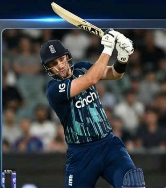
Liam Livingstone ₹13.0 Cr - Power Hitter