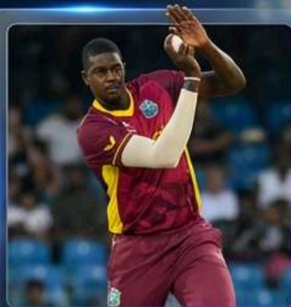
Jason Holder ₹7.0 Cr - All-Rounder